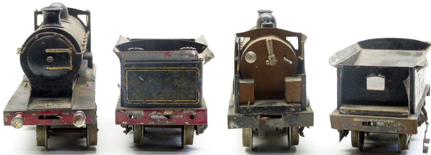
Plate work improvement/Repair/Replacement parts: